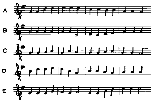
FIG. 3. The first two phrases of each of the undistorted versions of melodies used in Expt. 2: (a) "Twinkle, Twinkle, Little Star"; (b) "Good King Wenceslaus"; (c) "Yankee Doodle"; (d) "Oh Susanna"; and (e) "Auld Lang Syne."

and ascending two octaves (to 2093 Hz). Every effort was made to maintain the same tempo in all stimuli. Stimuli were tape recorded and played to the subjects over loudspeakers as in Expt. 1.