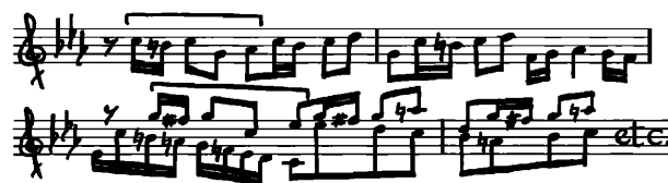
FIG. 2. The beginning of "Fuga II" by J. S. Bach. The first phrase of the subject is bracketed in each appearance.

Note that the versions shown in Expressions 4-7 of this brief phrase preserve not only the contour of Expression 3, but the relative sizes of temporally adjacent intervals as well. Using mathematical symbols to express the relationships between successive intervals in which the absolute value of the first interval of each pair is smaller than, equal to, or larger than that of the